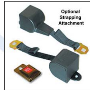
Optional Strapping Attachment